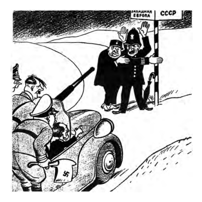
A cartoon published in the Soviet Union, 1939. The signpost says left to western Europe and right to the USSR.